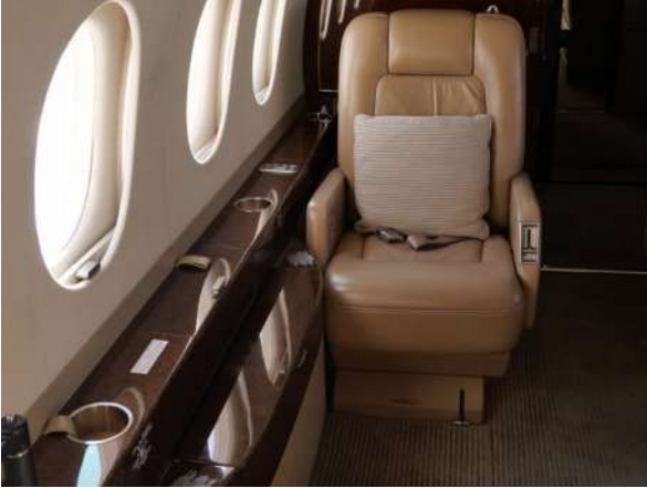
Individual seat detail