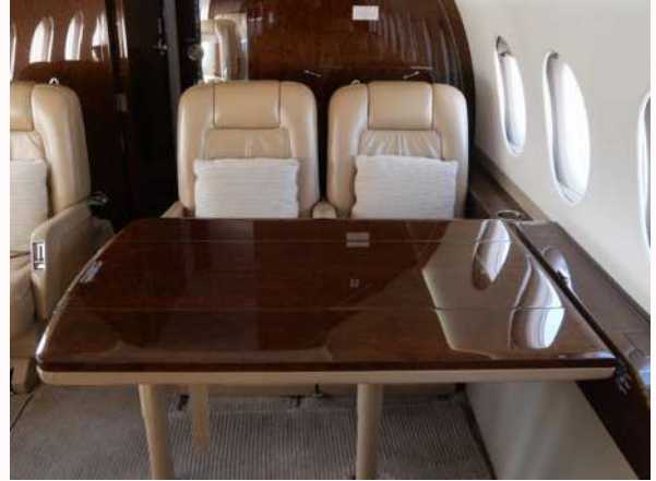
Conference table detail