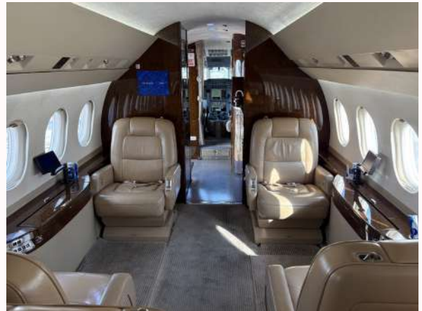
Club seating detail