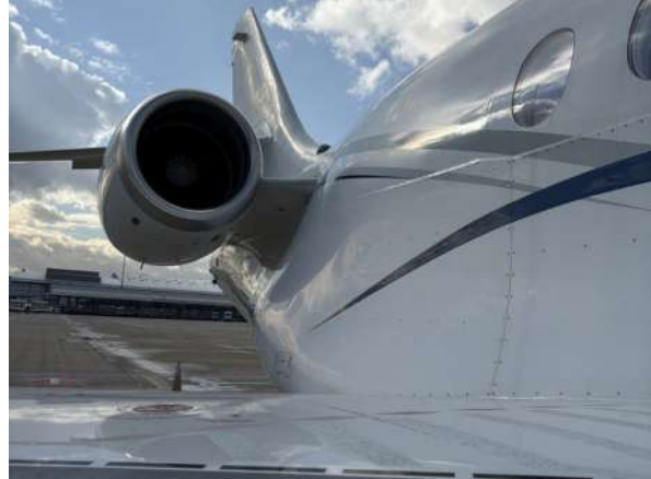
Exterior and engine detail