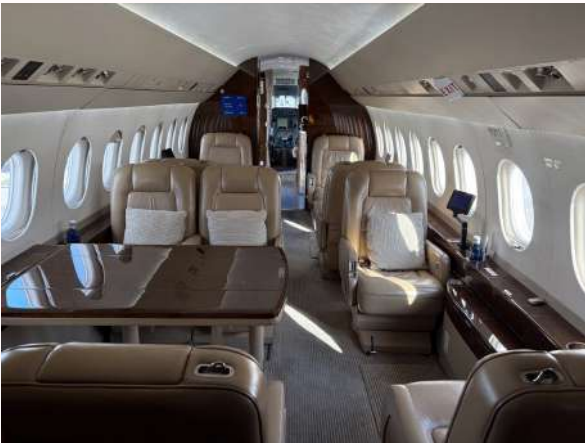
Aft cabin overview