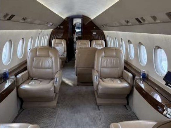
Forward cabin seating